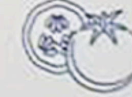
TOMATOES & CUCUMBERS