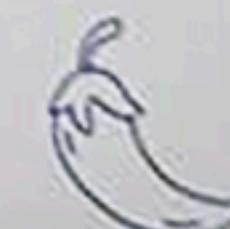
HARISSA HOT SAUCE