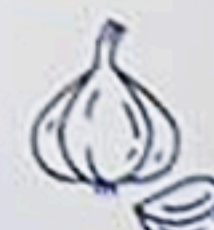
TOUM GARLIC SAUCE